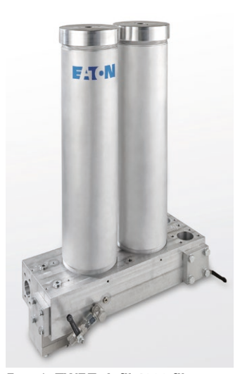
Eaton's TWF Twinfil 4000 filter systems are especially designed for gear lubrication systems in wind turbines. Each of the "filter pipes" holds one of Eaton's 01.NR.1000 filter elements and a 2-stage Twinfil filter element.

The custom designed TWF Twinfil filter system is fulfilling the requirements of the gearbox manufacturer. Essential was the success in reducing the weight of the filter systems by 78%, which was key to reduce the overall weight of the gearboxes. In this pilot project Eaton was providing more than 80 units of TWF Twinfil 4000 and 6000 filter systems for the different wind turbines in the park. Both have proven to de-aerate oil under all operating conditions, enhancing the reliability and efficiency of the gearbox and its lubrication system by assisting users in maximizing output while minimizing downtime and operating costs. An additional benefit for the gearbox manufacturer is that the new TWF Twinfil filter system meets all the relevant safety certifications for wind turbine applications worldwide.